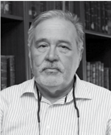
Prof. Dr. İLBER ORTAYLI - Historian, Academician, Writer